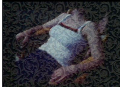
Fig. 2. A frame from Do You Remember This Movie? (1979).

We face, then, a set of complex relationships among: one ‘original’ artwork created in 1979; a different version with the same title dated 1982; a home-movie film (with no title) made between 1975 and 1976 by the same artist; and a multimedia installation with a temporal component constituted by four different videos, among which Do You Remember this Movie? , and a spatial component, including the room, a green bench and four photographs (see Fig. 1). Note also that the multimedia installation exists only through the para-textual documentation and the testimony of the artist.