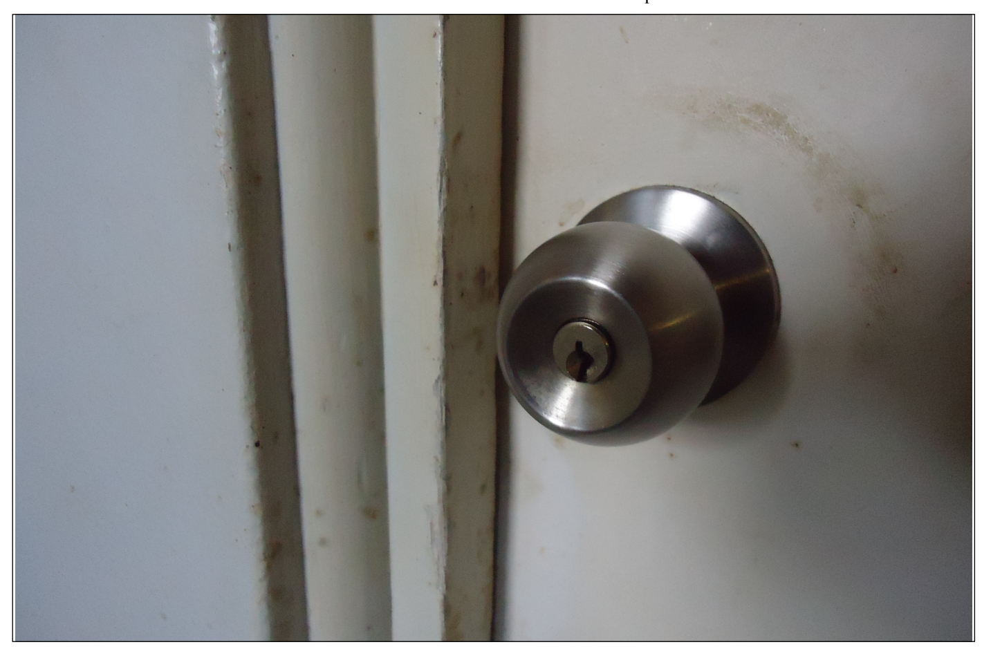
16.2 Bedroom 2 lock. I do not have access.

16.1 Bedroom 1 lock. I have access to this bedroom. The lock for the unit is "do not duplicate".