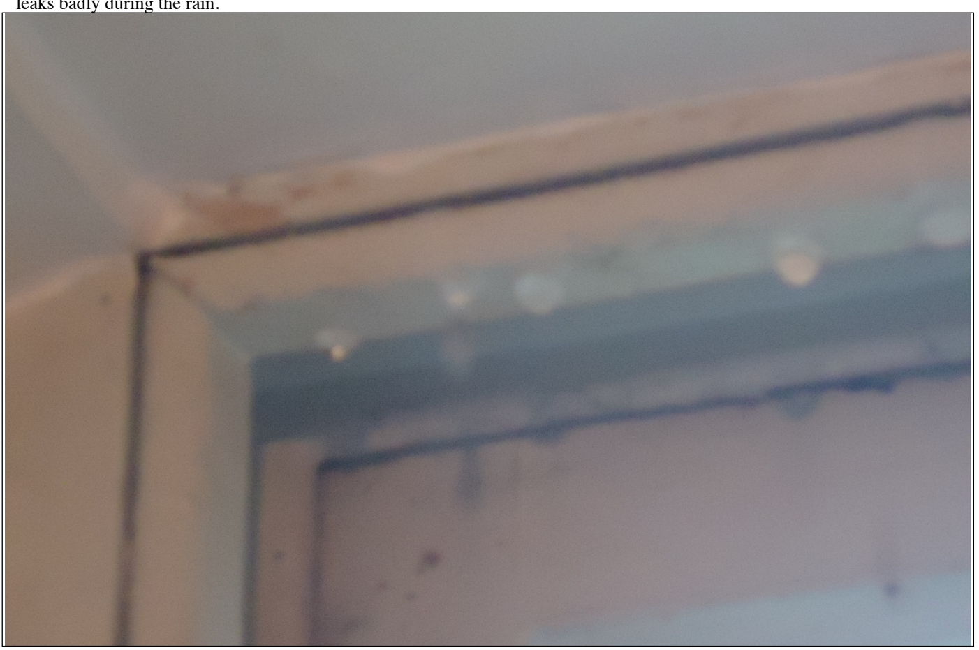
11.2 Toilet window. 21 Mar 2021. Leaking badly, during rain.

In addition to the common problem (unuseable; stuck shut), a new problem, after the tree outside was trimmed. The window leaks badly during the rain.